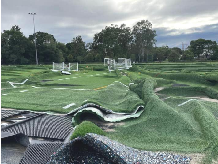
Damaged artificial turf soccer fields at Mitchelton Football Club, in Everton Park.

During Brisbane's flood emergency, water washed over local sporting clubs. They have the massive task of cleaning up, and competitions are disrupted as clubs repair infrastructure.